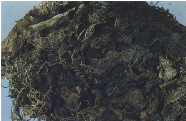
11.10d Gray mold; black sclerotia of Botrytis cinerea on dead lettuce tissue.