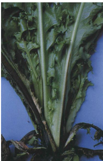
11.3d Pseudomonas diseases; petiole rot of lettuce.