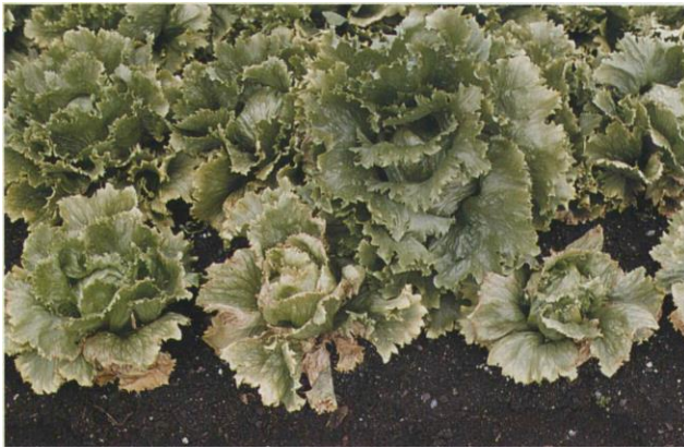
11.19a Manganese deficiency; lettuce appears stunted, yellow-gray, with necrotic spots on leaf margins.