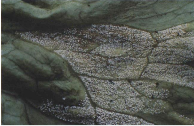
11.8a Downy mildew; sporulation of Bremia lactucae on lettuce leaf.