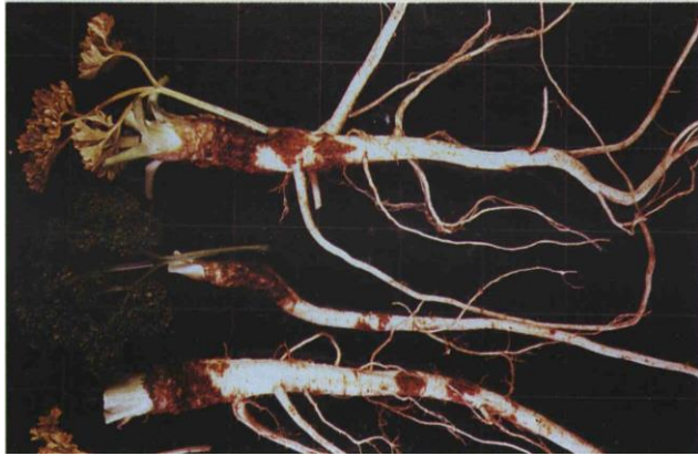
10.15b Carrot rust fly; larval feeding damage on parsley roots.