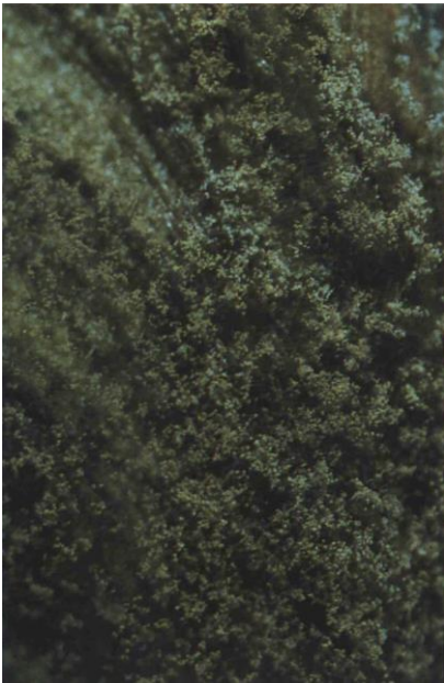
11.10f Gray mold; conidia of Botrytis cinerea on lettuce leaf.