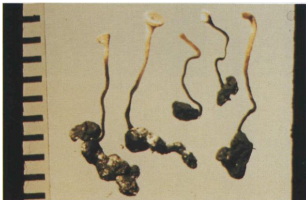
11.9e Drop; aggregated sclerotia and apothecia of Sclerotinia minor .