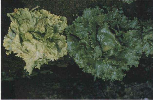
11.15b Aster yellows; affected (left) and healthy lettuce plants.