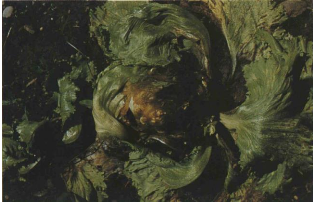
11.1b Slime rot; decay of a lettuce head caused by Erwinia carotovora .