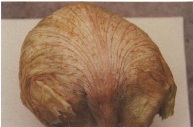
11.20 Pink rib and russet spot (small pits); severely affected lettuce head.