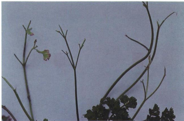
10.15c European earwig; severe defoliation of young parsley.