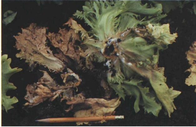
11.9b Drop; lettuce infected by Sclerotinia sclerotiorum ; note white mycelium and large black sclerotia.