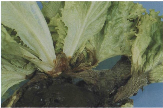
11.10c Gray mold; basal stem infection of lettuce; note gray growth of Botrytis cinerea on petioles.