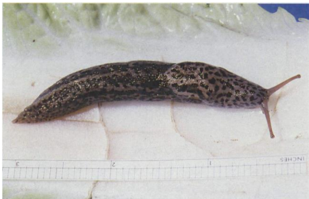
11.27b Spotted garden slug; scale in inches; length \geq 100 mm.