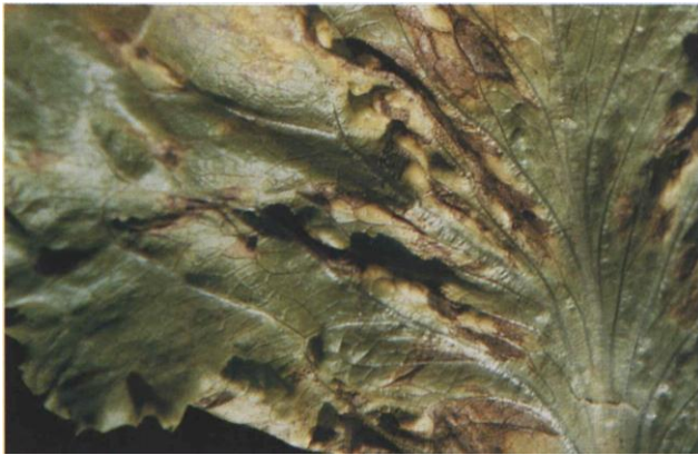
11.8b Downy mildew; a severely affected lettuce leaf.