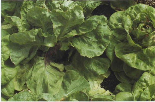
11.10b Gray mold; head infection of butterhead (Boston) lettuce.