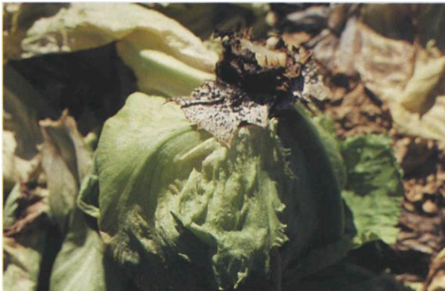
11.9d Drop; lettuce infected by Sclerotinia minor ; note small black sclerotia at base of plant.