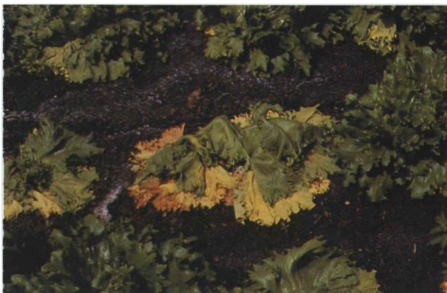
11.7b Stunt; lettuce plants killed by Pythium sp.