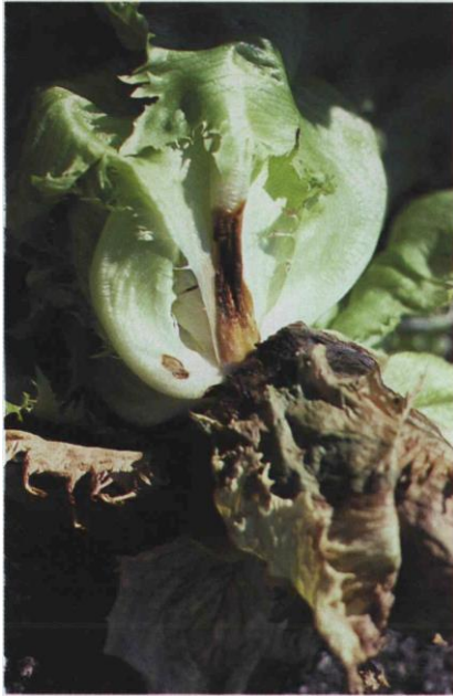
11.6a Bottom rot; basal decay on lettuce.