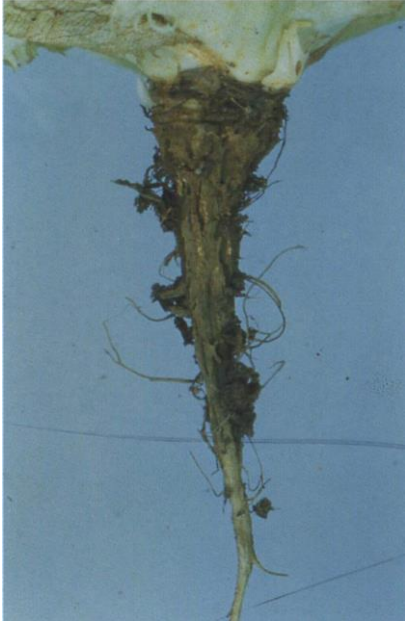
11.10e Gray mold; root rot of lettuce.