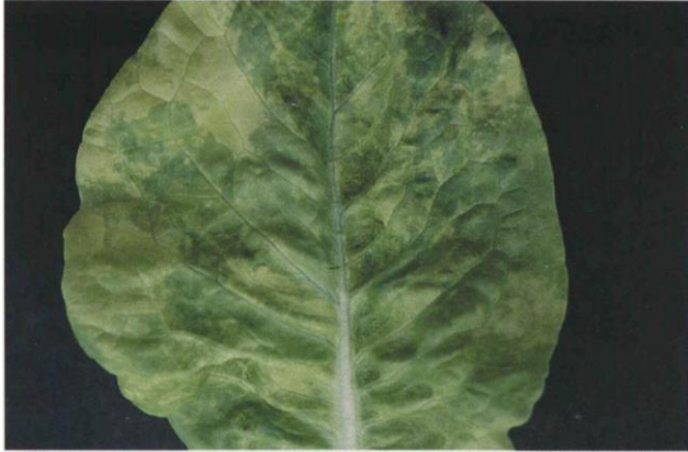
11.17b Lettuce mosaic; mosaic pattern on an affected lettuce leaf.