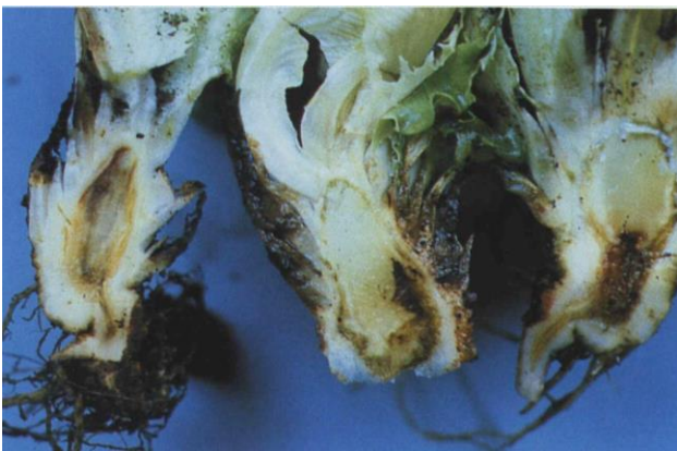
11.7c Stunt; discoloration of crown tissue of lettuce caused by Pythium sp.