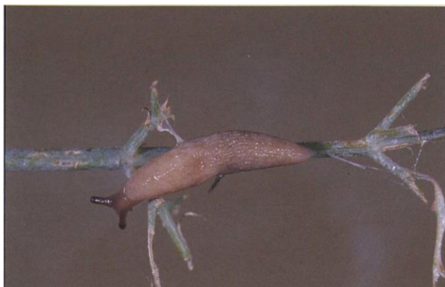
11.27c Gray garden slug; juvenile with severe feeding damage on dill; length 35-50 mm.