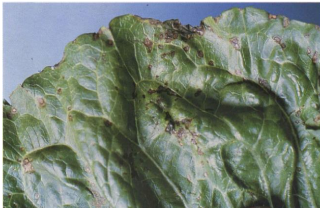
11.3a Pseudomonas diseases; brown rot lesions (individual spots) on lettuce.