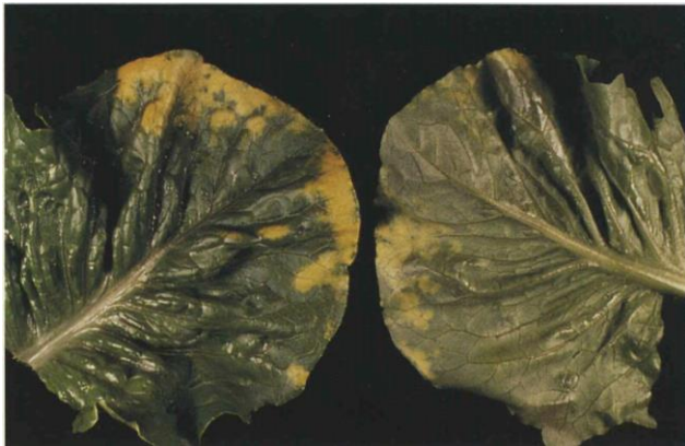
11.19b Manganese toxicity; chlorosis on Romaine lettuce leaves.