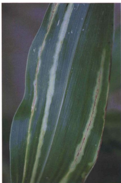
12.1a Stewart's wilt; pale green streaks on leaves later turn brown.