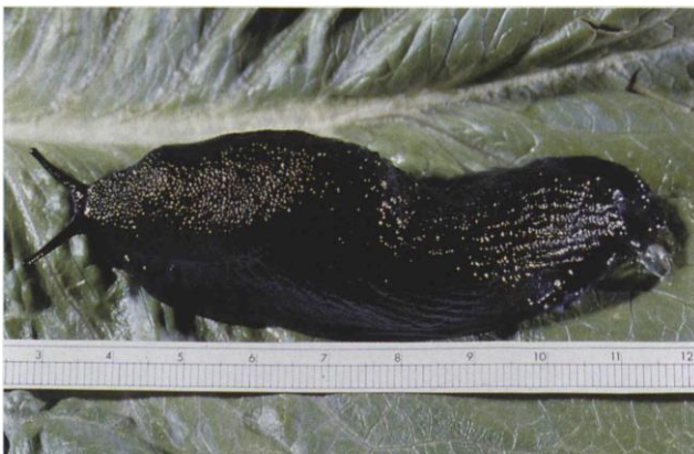
11.27a Black slug; side view (contracted), scale in cm; length up to 150 mm.