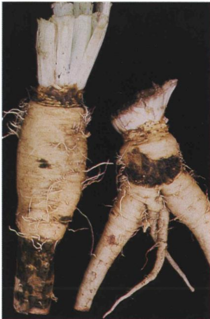
11.5 Black root rot; lesions on chicory roots.