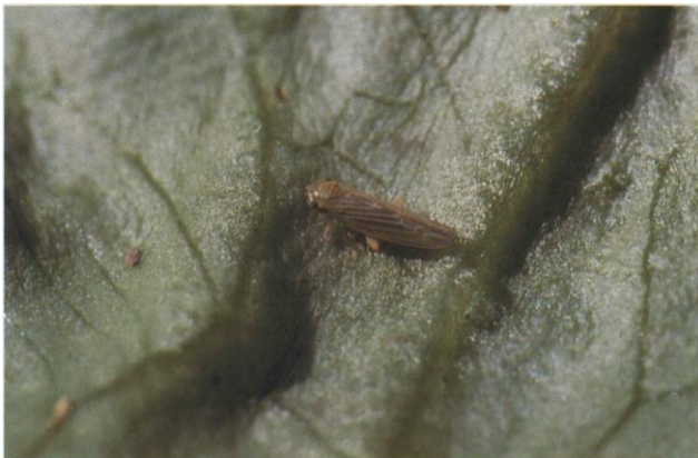
11.23a Aster leafhopper; adult; length \pm 3 mm.