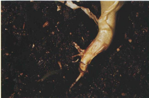
11.9c Drop; stem infection on lettuce.