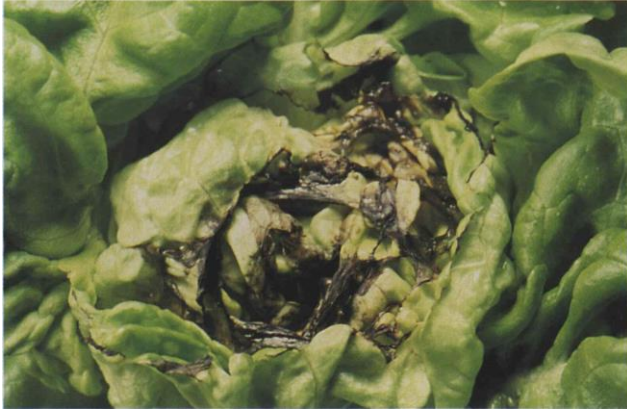
11.19c Tipburn; symptoms on the inner leaves of lettuce head.