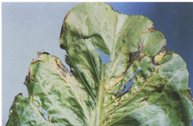
11.3b Pseudomonas diseases; marginal leaf spot of lettuce caused by Pseudomonas fluorescens .