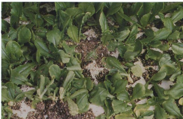
11.7a Damping-off; wilted lettuce seedlings.