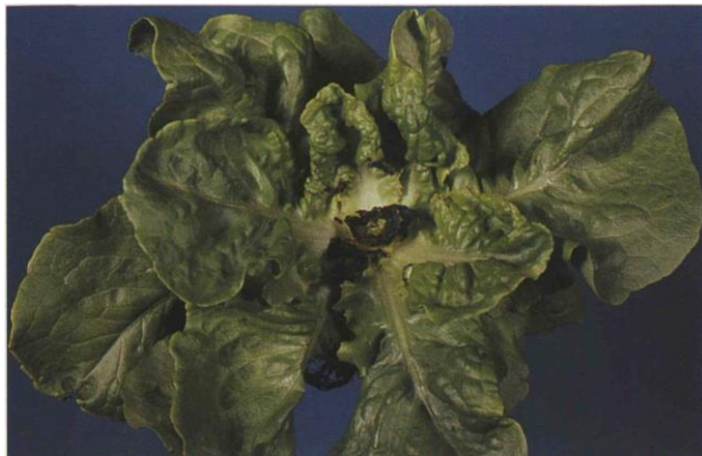
11.1a Head rot; breakdown of the youngest leaves in lettuce head.