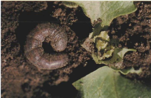
11.26 Redbacked cutworm; curled larva and its feeding injury on lettuce.