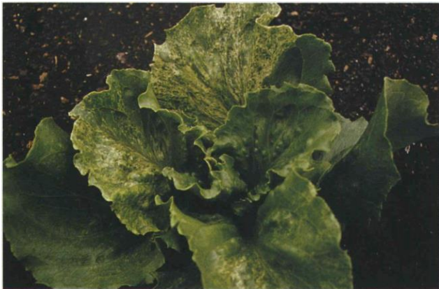
11.17a Lettuce mosaic; an affected lettuce plant.