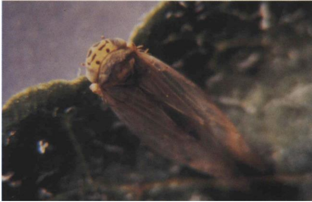
11.23b Aster leafhopper; adult, showing diagnostic head spotting.