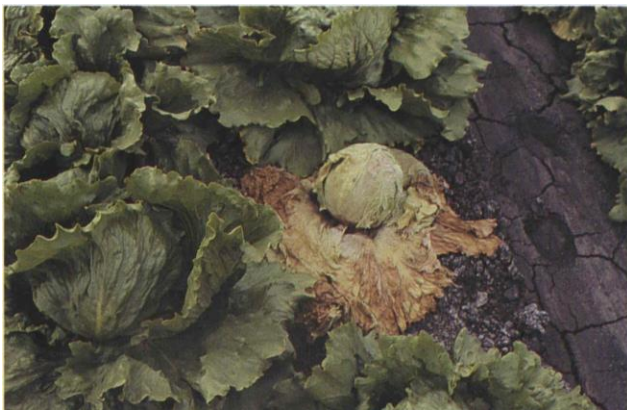
11.9a Drop; lettuce plant infected by Sclerotinia minor .