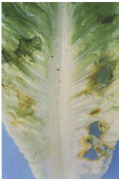
11.3c Pseudomonas diseases; brown rot lesions on lettuce.