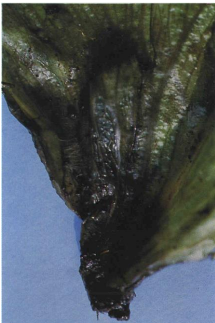
11.6b Bottom rot; severe decay of lettuce petiole.