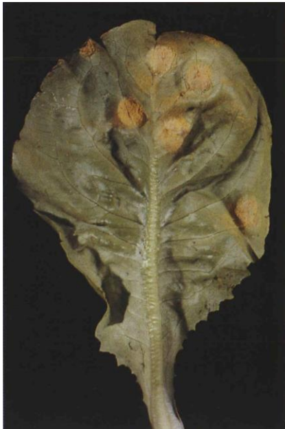
11.13a Rust; lesions on lettuce leaf.