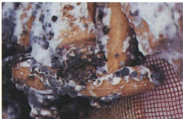
11.9f Drop (white mold); severely decayed chicory roots from storage; note white mycelium and black sclerotia.