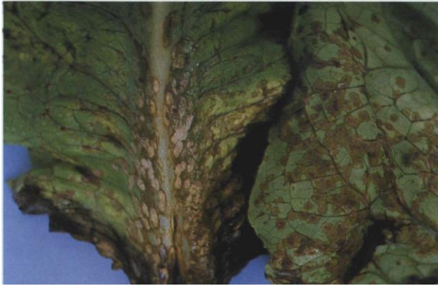
11.4 Anthracnose; lesions on lettuce leaves.