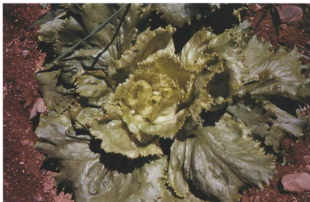
11.15a Aster yellows; chlorosis and bronzing of lettuce leaves.