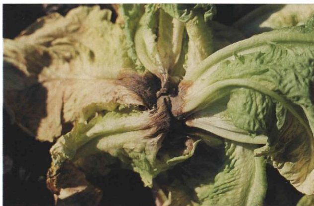
11.10a Gray mold; crown decay of iceberg lettuce head.