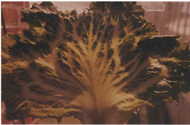
11.16 Big vein; an affected lettuce leaf.