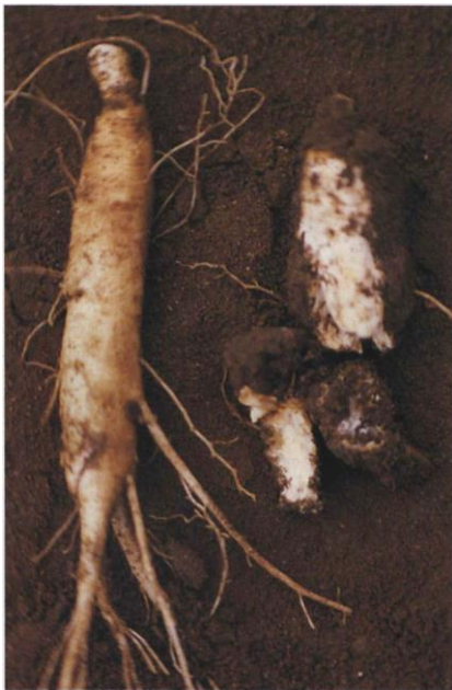
20.5 Phytophthora mildew and root rot; healthy and affected (right) roots.