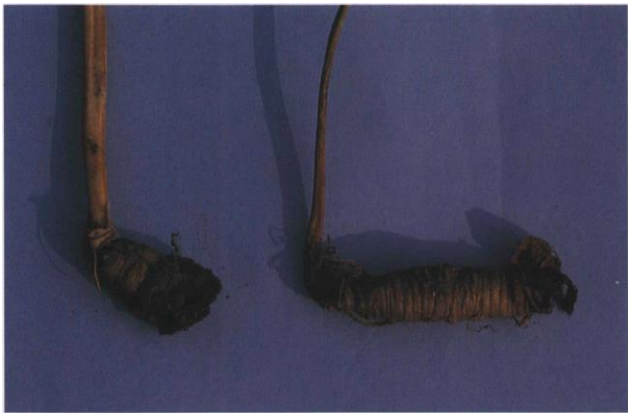
20.4b Disappearing root rot; advanced root decay.