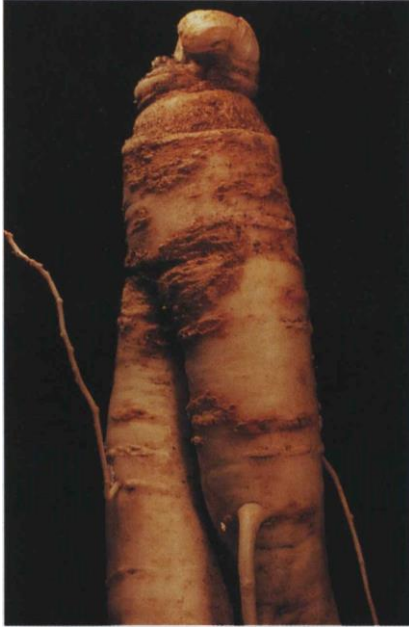
20.6 Rusted root; raised, reddish brown lesions may girdle root.