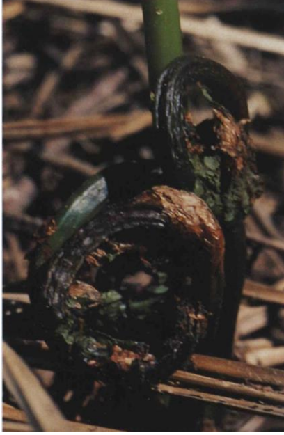
19.1 Gangrene; blackened fronds of fiddlehead (ostrich fern).