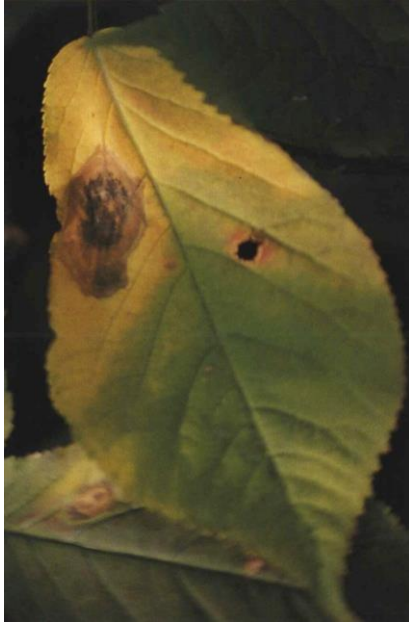
20.2 Botrytis blight; leaf lesion on a 3-year- old ginseng plant.