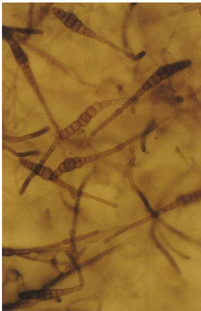
20.1c Alternaria blight; conidia of Alternaria panax .