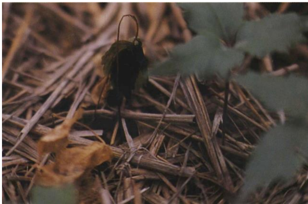
20.3a Damping-off; ginseng seedling (left) killed by Alternaria panax stem infection.