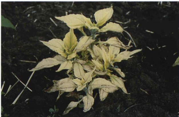
21.1a Apical chlorosis; severely affected plant.