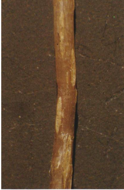
20.1b Alternaria blight; lesions near the soil line on a ginseng stem.