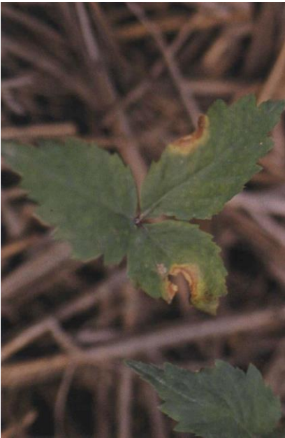
20.1a Alternaria blight; leaf lesions on a 1-year-old ginseng plant.