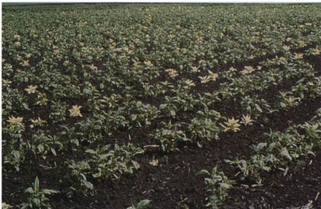
21.1b Apical chlorosis; stunted, chlorotic plants in a field.