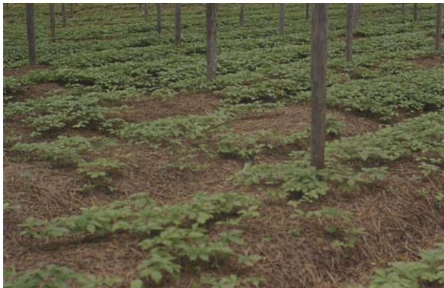
20.3b Damping-off; circular patches of ginseng plants lost to Rhizoctonia solani infection.