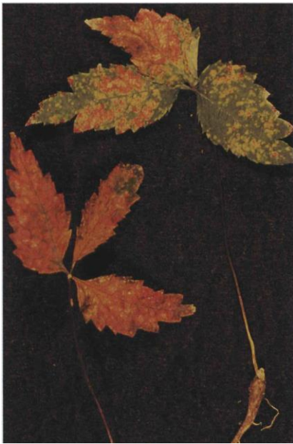
20.9c Phytotoxicity; chemical injury on leaves.