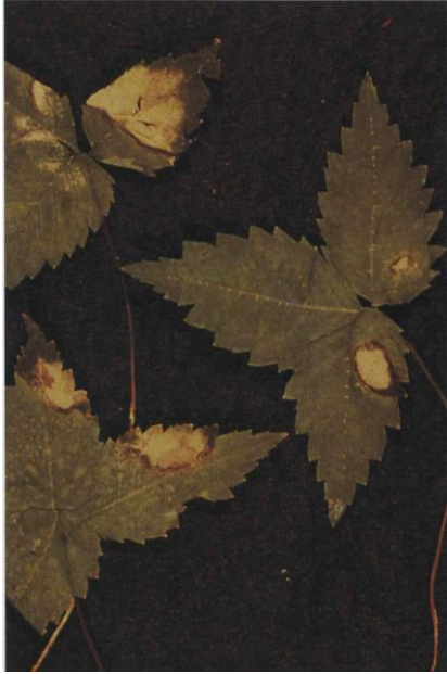
20.9d Sunscald; injured foliage.