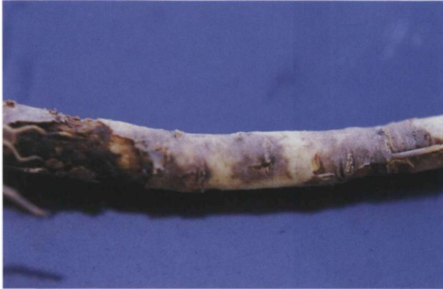
20.4a Disappearing root rot; superficial root rot lesions.