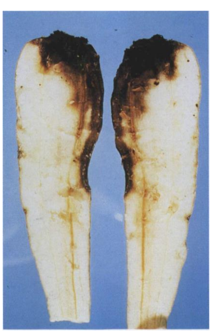
14.3d Phoma canker; lesion on shoulder and crown of a parsnip root.