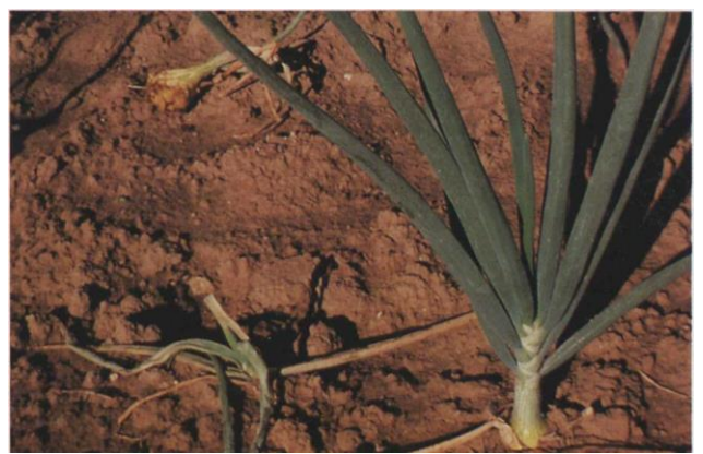
13.26e Onion maggot; infested (left) and healthy onion plants.