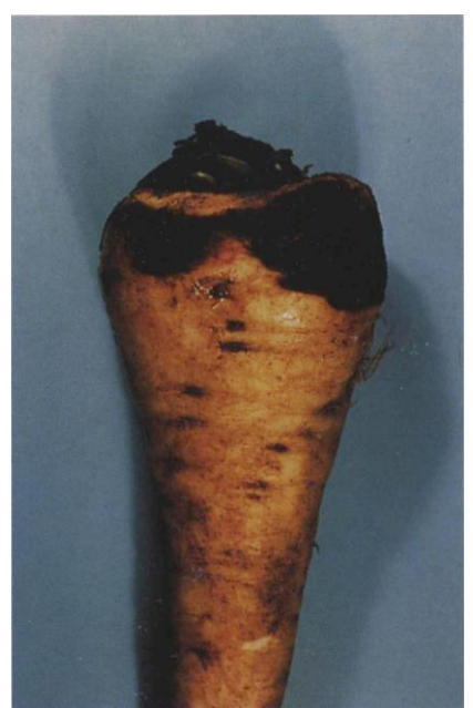
14.2a Itersonilia canker; lesion on the shoulder of a parsnip root.