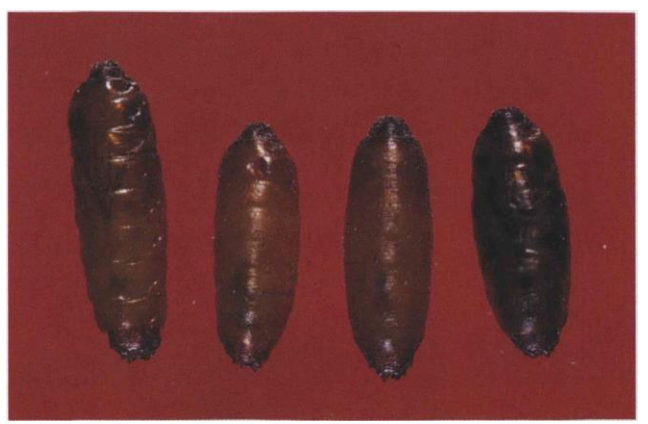
13.26d Onion maggot; pupae; length 5-7 mm.