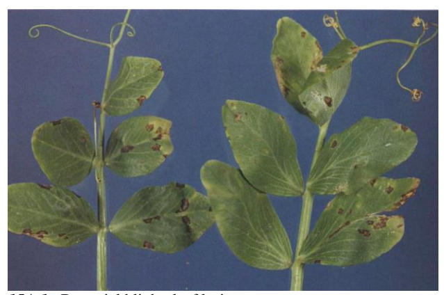
15A.1a Bacterial blight; leaf lesions.