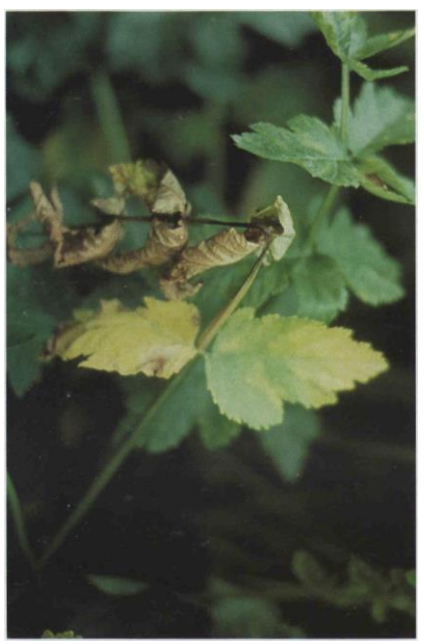
14.3c Phoma canker; on upper petiole, forming "shepherd's crook."