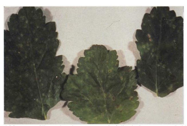
14.2c Itersonilia canker; brown necrotic foliar lesions surrounded by pale green halos.