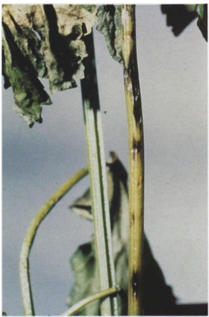
14.3a Phoma canker; light brown lesions become dark and form cankers on petioles.