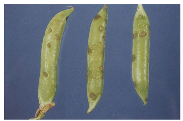
15A.1b Bacterial blight; pod lesions.