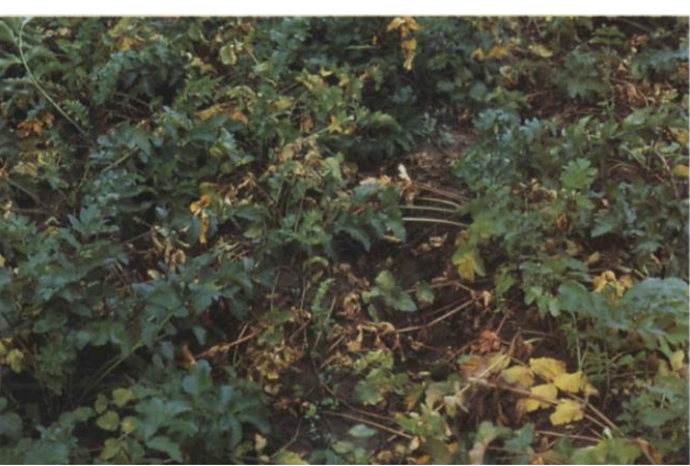
14.3b Phoma canker; leaf blight symptoms.