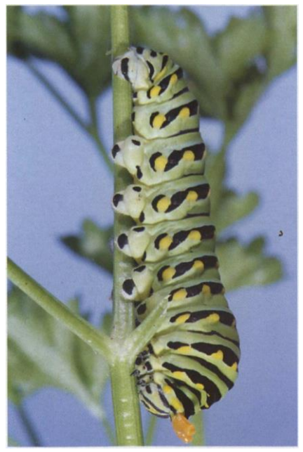
14.7 Black swallowtail; mature larva with scent glands extended.