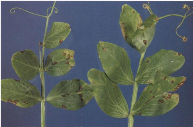
15A.1a Bacterial blight; leaf lesions.