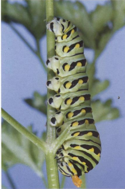
14.7 Black swallowtail; mature larva with scent glands extended.