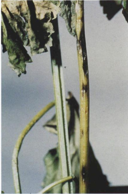
14.3a Phoma canker; light brown lesions become dark and form cankers on petioles.