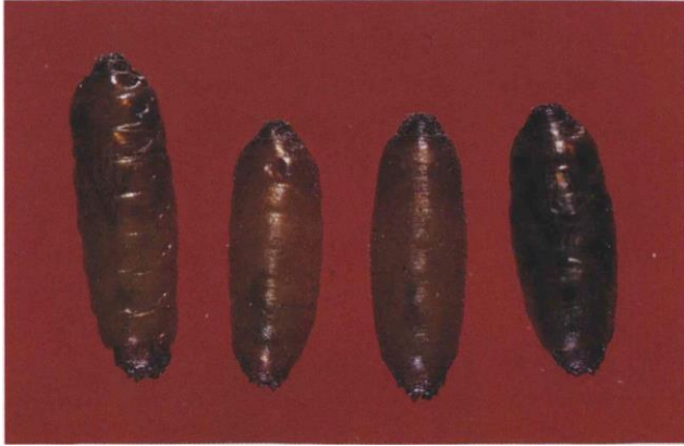
13.26d Onion maggot; pupae; length 5-7 mm.