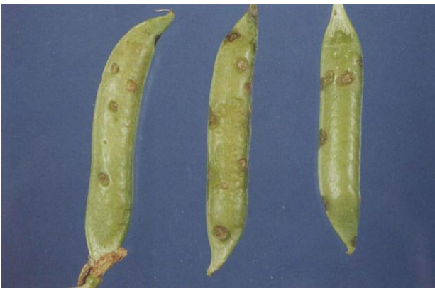
15A.1b Bacterial blight; pod lesions.