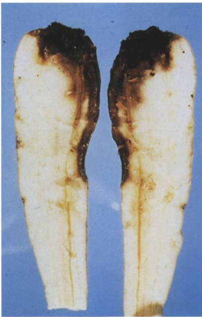
14.3d Phoma canker; lesion on shoulder and crown of a parsnip root.