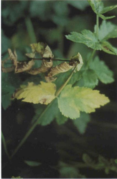
14.3c Phoma canker; on upper petiole, forming "shepherd's crook."