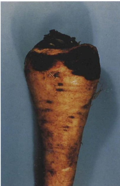
14.2a Itersonilia canker; lesion on the shoulder of a parsnip root.