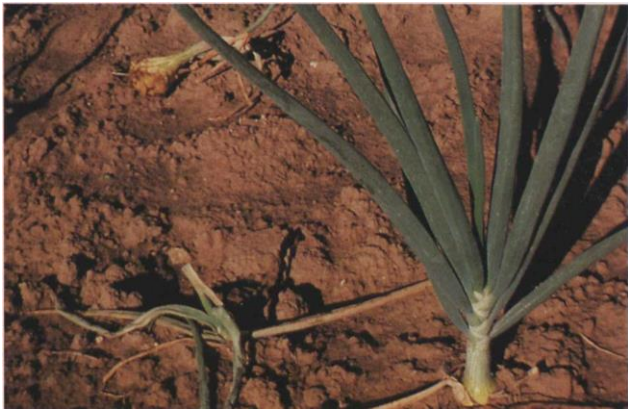
13.26e Onion maggot; infested (left) and healthy onion plants.