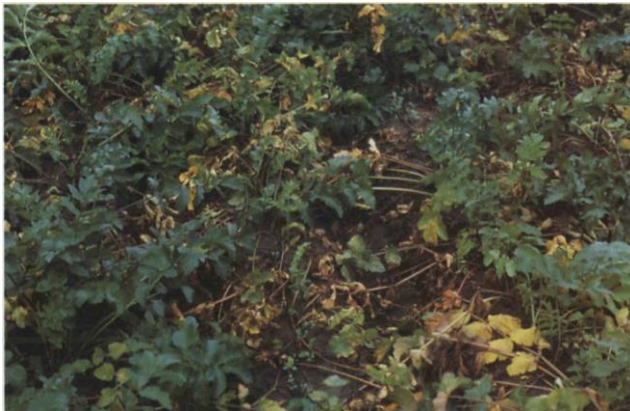
14.3b Phoma canker; leaf blight symptoms.