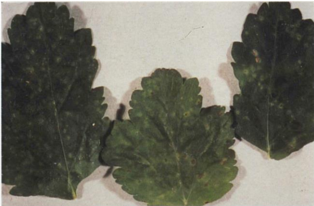
14.2c Itersonilia canker; brown necrotic foliar lesions surrounded by pale green halos.