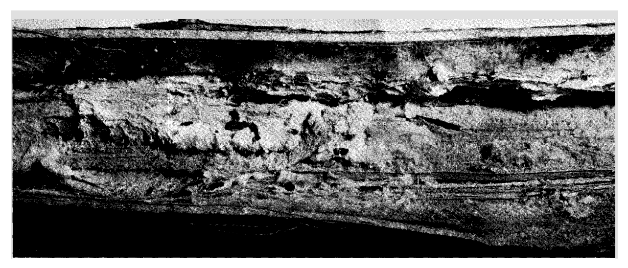
Fig: 2. A longitudinally split stem of cigar tobacco cv. Ottawa 705 infected with B . cinerea. Notice the densely growing mycelium, spores, and the black sclerotia attached to the pith tissue

was visually rated and the average per cent rot-coverage on the 15 replicate disks represented the disease index of the treatment. The test was repeated.