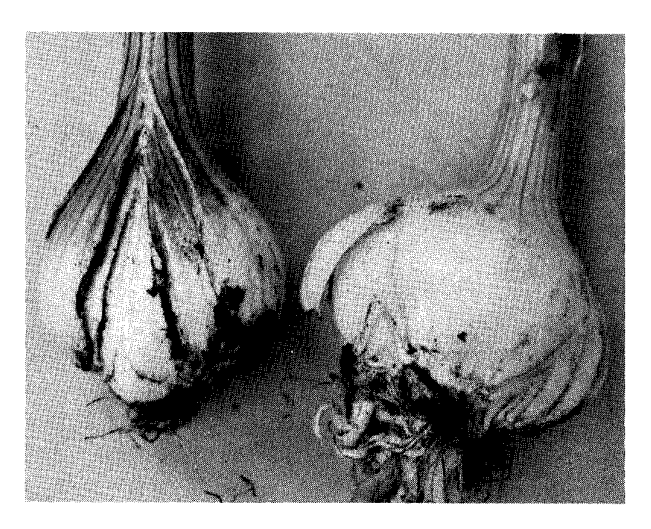
Figure 2. Diseased onion bulbs in later growth. Note splitting of the outer layers of scales and swelling of the inner layers which tend to bulge out through the split. The split extends into the root region which often gives rise to distorted, leaf-like shoots as shown in the bulb on the right.

important that movement of farm equipment and materials from the Cookstown to the Bradford area be avoided. If movement is necessary, all items should be thoroughly cleaned and disinfected. It is important that growers check the source of their seed and setts to insure that they are clean. Finally, growers should inspect their fields periodically and report occurrence of plants which bear symptoms of this disease in order that any introduction may be recognized early and curbed before it becomes widespread.