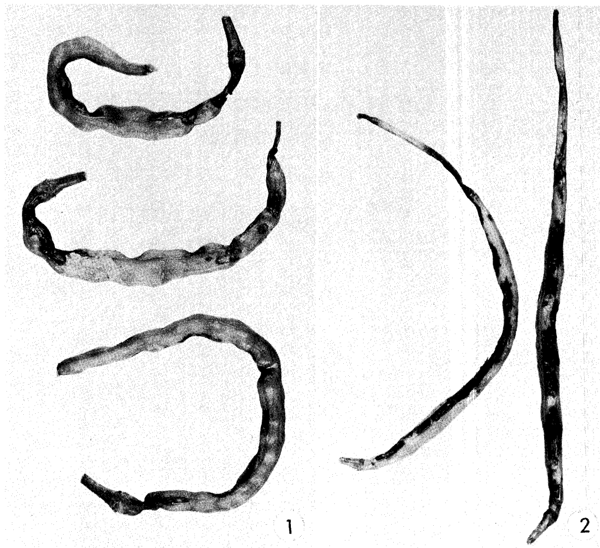
Figures 1 and 2. Pods of Span rape affected with bacterial pod spot, collected from two fields at Rockyford, Alberta. 1) Deformed pods: note dried exudate on lesions of central pod. 2) Pods from a second field show less deformity than those in Figure 1, possibly as a result of later infection.

for those of the incubation period. These pods were sprayed after inoculation with sterile water and covered with plastic bags moistened inside to assure high humidity around the pods. The plants bearing the inoculated pods were then placed in a growth chamber at 21 - 23 C.