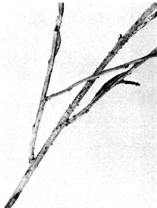
Figure 1. Three-year-old shoot of lowbush blueberry infected with Godronia cassandrae f. vaccinii .

In April 1970, F. putrefaciens was isolated from cankers found on lowbush blueberry plants in a headland bordering a commercial highbush blueberry field at Sheffield in Kings County, N.S. (Figures 1 and 2). At Debert in Colchester County, cankers were found on 5% of the plants in hedgerows and in scattered areas of a poorly burned commercial lowbush blueberry field. Severely infected clones were found by the roadside near Musquodoboit, Halifax County, and on plants near a cranberry bog at Aylesford, Kings County. Recently G. cassandrae f. vaccinii was isolated from a sample of lowbush blueberry plants from a commercial field at Lewes, Prince Edward Island.