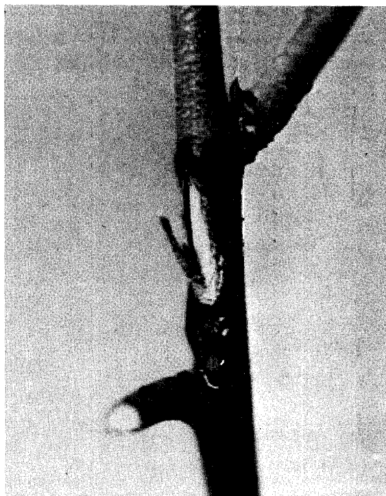
Figure 3. Canker produced on lowbush blueberry artificially inoculated with Fusicoccum putrefaciens .

culture. The incisions were wrapped with moistened cotton held in place with cellulose tape. One week after inoculation the cotton was removed. Controls consisted of incisions without inoculum.