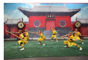
Shaolin Temple ($45 US/person)