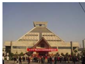
Henan museum (Free)

Conference tours will be arranged for the conference participants and accompanying persons.