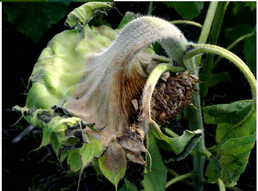
“Sclerotinia Head Rot of Sunflower”