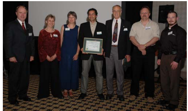
A Certificate of Appreciation for the SPEC Committee for their exceptional work on special activities during the 75th anniversary of the CPS-SCP.