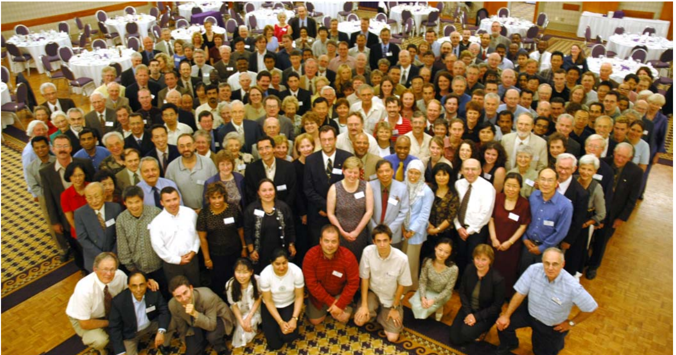
Banquet attendees, 75th anniversary meeting of the CPS-SCP, Ottawa 2004