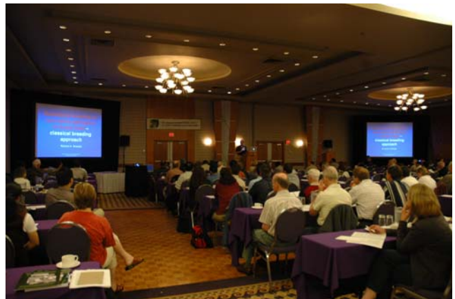
Main meeting room, 2004 CPS-SCP Annual Meeting.