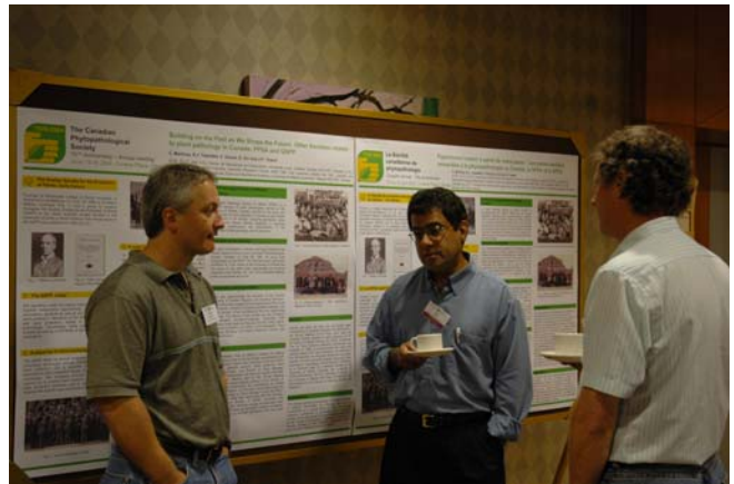
Time for a quick coffee and a little discussion!