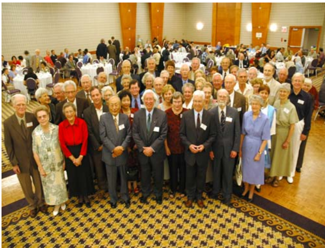
Emeritis members of the CPS-SCP.