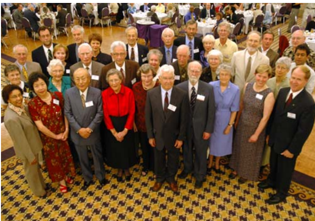
Past Presidents of the CPS-SCP.